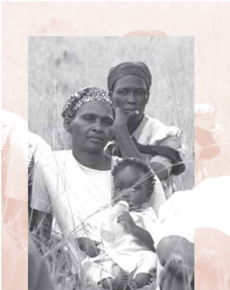
THE DIALOGUE FORESEES DEVELOPMENT OF AN ETHICAL CODE OF BEST PRACTICE FOR INTERACTIONS BETWEEN INDIGENOUS PEOPLES AND THE MINING INDUSTRY.

(a) Effective engagement and participation: Community and indigenous peoples need to be involved in the decision-making to ensure integration of social issues from the outset, through all stages of operation and post-closure, including monitoring and assurance (of compliance with agreed principles and standards) Transparency and accountability should underpin all company-community relationships. The concept of consensus-orientation should be employed, while also recognizing existing community decision-making processes. Capacity-building to ensure effective engagement is required among all groups – communities, regulators and company employees. NGOs have a key role to play in building capacity among communities. Mechanisms need to be established to support and provide expertise for smaller companies with few in-house resources. Companies need to work with and strengthen community institutions and mechanisms as they exist more than to undermine them by imposing new organizations or supporting divisions and rivalries among existing ones. Similarly, the communities need to engage in good faith with companies.