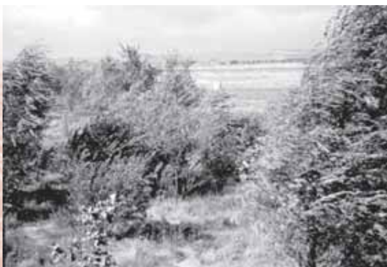
REHABILITATION AND RESTORATION EFFORTS SHOULD BE GUIDED BY SPECIFIC MANAGEMENT PLANS. PICTURED: LEAD-ZINC-FLUORSPAR TAILINGS IN THE PEAK DISTRICT NATIONAL PARK (UK) TWO YEARS AFTER SEEDING IN A TREE/SHRUB LANDSCAPING SCHEME.