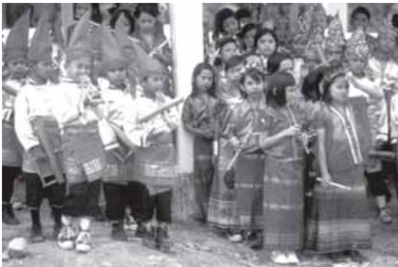
DIALOGUE PARTICIPANTS EXPRESSED CONCERN OVER SAFEGUARDING OUR CULTURAL HERITAGE AS WELL AS OUR BIOLOGICAL AND LANDSCAPE HERITAGE.

It is fair to suggest that while progress was made at the workshop more will be needed from here on out and on key issues such as protected areas and directly affected stakeholders. Companies need to work with and strengthen community institutions and mechanisms as they exist more than to undermine them..... Similarly the communities need to engage with companies in good faith and on terms agreed with mutual consent.