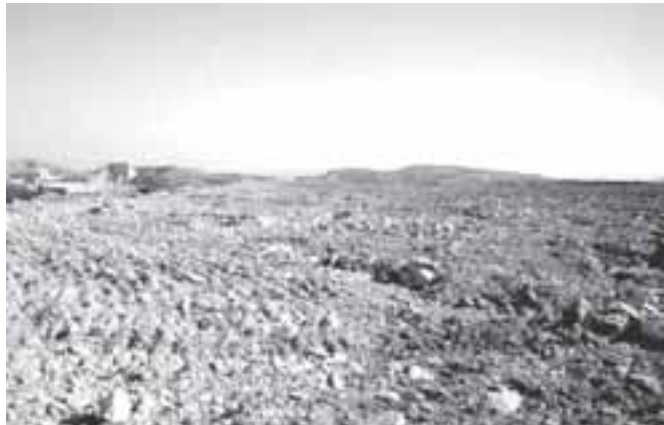
INVESTORS ARE ASKING COMPANIES TO ADDRESS BIODIVERSITY ISSUES SUBSTANTIVELY IN ORDER TO LIMIT THEIR EXPOSURE TO LIABILITIES. PICTURED: WASTE ROCK DUMP CLOSE TO THE OLD RIO TINTO CU-AU WORKING IN SOUTHERN SPAIN.

The government view indicated that although there is buy-in to the sustainable development agenda, there remain inconsistencies in implementation. Specific to biodiversity, legal frameworks around biodiversity conservation and protected areas tend to be segregated from and at times inconsistent with other legal frameworks. This creates a difficult operating environment for companies in the mining sector – in particular where mining legislation allows activities in areas which are formally protected, or where areas become protected after mining concessions have been approved. Furthermore, there is recognition that there are few mechanisms for resolving conflicts arising out of this situation.