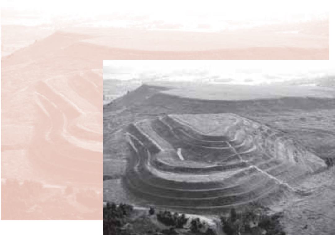
THE DIALOGUE URGES THE DEVELOPMENT OF COMPREHENSIVE CLOSURE PLANS AT THE PLANNING STAGE OF A MINE. PICTURED: REHABILITATION FOR CLOSURE.

structure and functioning. Engineering and environmental considerations may be priorities but plans should include biodiversity options and imperatives. The duration of post-closure monitoring should be based on the sustainable achievement of biodiversity targets.