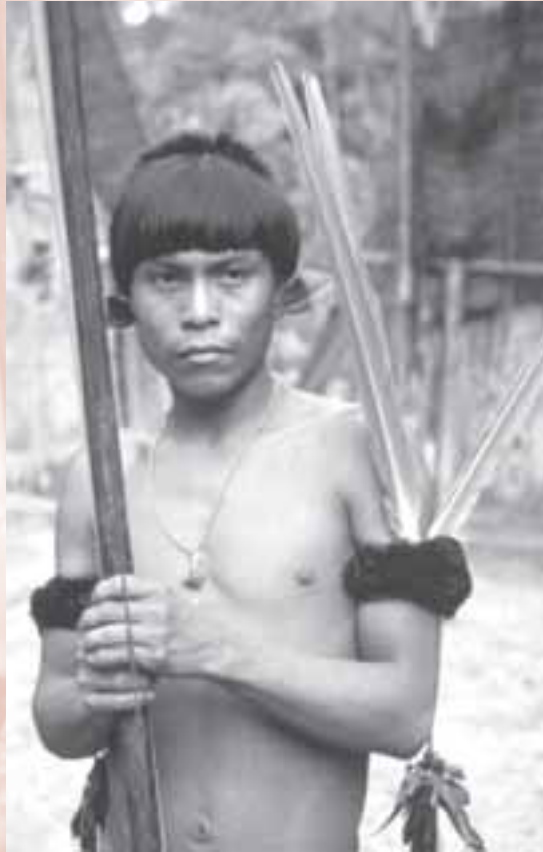
THE DIALOGUE GIVE PRIORITY TO EXPLORING THE ISSUES SURROUNDING INDIGENOUS PEOPLES AND THE EXTRACTIVE INDUSTRIES.

(b) Undertake comprehensive identification of actual biodiversity impacts: Regularly reassess and review potential and actual biodiversity impacts, including those that are direct, indirect, transient, permanent, localised, dispersed, positive and negative. Plan and design the identification process to enable significant secondary or cumulative effects to be monitored and addressed.