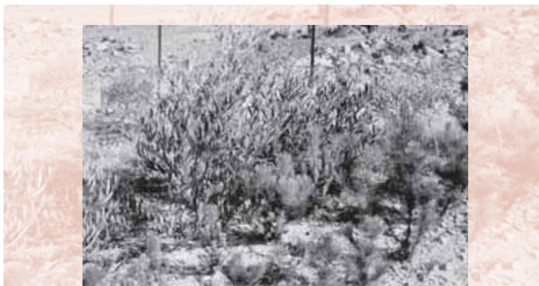
THE DIALOGUE REPRESENTED CONSTRUCTIVE ENGAGEMENT AMONG STAKEHOLDERS ON A SENSITIVE ISSUE, AND TOOK A GIANT STEP TOWARD DEVELOPMENT OF BEST PRACTICE GUIDANCE FOR THE MINING INDUSTRY. PICTURED: 'BEST PRACTICE' ON THE GROUND: A REVEGETATION TRIAL ON WASTE ROCK TESTS TREE AND SHRUB COMBINATIONS MOST SUITED TO LOCAL CONDITIONS AND 'SUSTAINABLE' IN THE LONG TERM.

If the journey of a thousand miles begins with the first step, this has now been taken. However, the world will not judge our efforts on where we come from, but on where and how far we go from here.