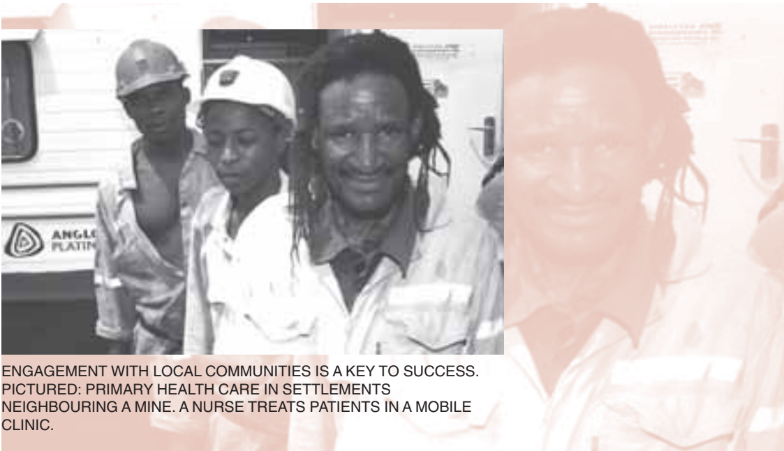
ENGAGEMENT WITH LOCAL COMMUNITIES IS A KEY TO SUCCESS. PICTURED: PRIMARY HEALTH CARE IN SETTLEMENTS NEIGHBOURING A MINE. A NURSE TREATS PATIENTS IN A MOBILE CLINIC.

(b) Legacy issues: Processes involving governments need to be established to address the legacy issues of mining, and these should address social impacts as well as environmental rehabilitation needs.