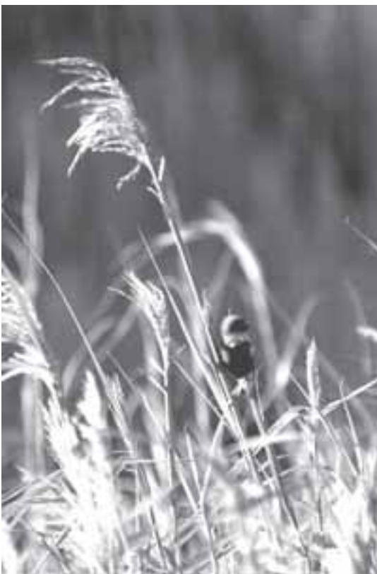
THE DIALOGUE IS ADDRESSING HOW TO INTEGRATE BIODIVERSITY ASSESSMENT INTO THE EIA PROCESS. PICTURED: WILDLIFE AND BIRDS LIVING ON TOP OF A SUCCESSFULLY REHABILITATED DUMP.

Thought starters and discussion papers, jointly authored by delegates from the conservation community and industry, provided a balanced overview of the state of the debate to enable the workshop discussions to be forward-looking and constructive. They provided the basis for the discussion of operating principles and key performance criteria in the first three areas. The fourth group focused on the critical community and indigenous peoples components of assessment, management and closure to provide feedback to each of the technical groups. The discussion in this group was informed by the background papers on social and gender equity and indigenous peoples' perspectives presented earlier in the workshop. A further over-arching theme of the best practice development process – that of industry's contribution to biodiversity conservation – was also covered by a discussion paper.