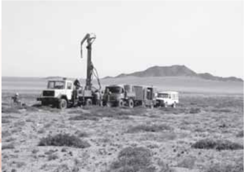
THE WORKSHOP CONSIDERED ALL STAGES OF THE MINING CYCLE. PICTURED: GEOLOGICAL AND GEOPHYSICAL SURVEYS AT AN EXPLORATION SITE IN NAMIBIA.

The business community has responded to this changing world by initiating processes of collective action to address the sustainable development agenda. The mining and metals industry launched the Global Mining Initiative (GMI) in 1999 which eventually led to the establishment of ICMM as the industry body with the mandate to take forward the industry recommendations emerging from the MMSD report (following a two year independent process of stakeholder consultation and analysis). Most recently, in May 2003, ICMM's Council approved the adoption of its Sustainable Development Framework, a set of ten guiding principles by which member companies will report their sustainable development performance.