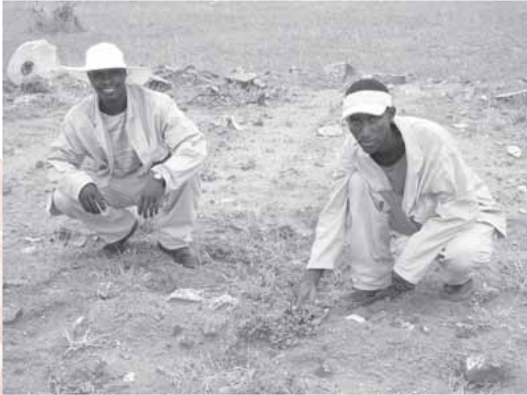
THE WORKSHOP NOTED THE IMPORTANCE OF CONSIDERING BIODIVERSITY EARLY IN A PROJECT, FOR INSTANCE WHEN EARLY DECISIONS ABOUT LOCATION ARE BEING MADE. PICTURED: A BOTANICAL SURVEY DONE PRIOR TO NEW OPEN PIT NEAR MOKOPANE, SOUTH AFRICA.