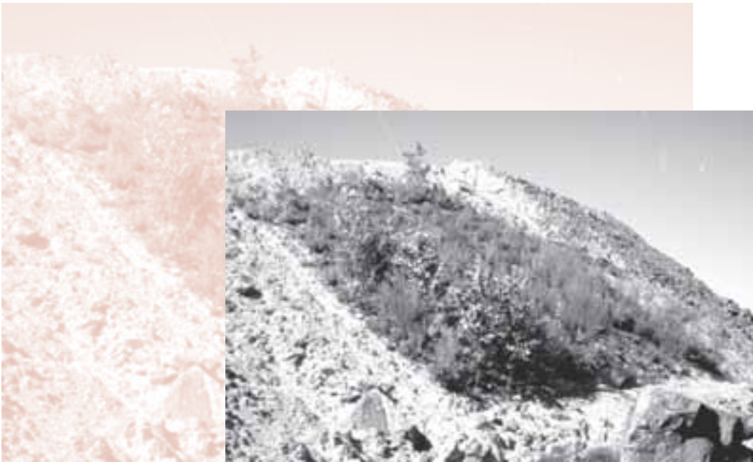
REHABILITATION EFFORTS SHOULD FOCUS ON LOCAL SPECIES. PICTURED: TWO YEARS OF GROWTH IN A TRIAL PLOT IN CORTA BAMA MAKING USE OF LOCAL, INDIGENOUS AND NATIVE SPECIES ONLY FOR RECLAMATION TRIAL WORK.