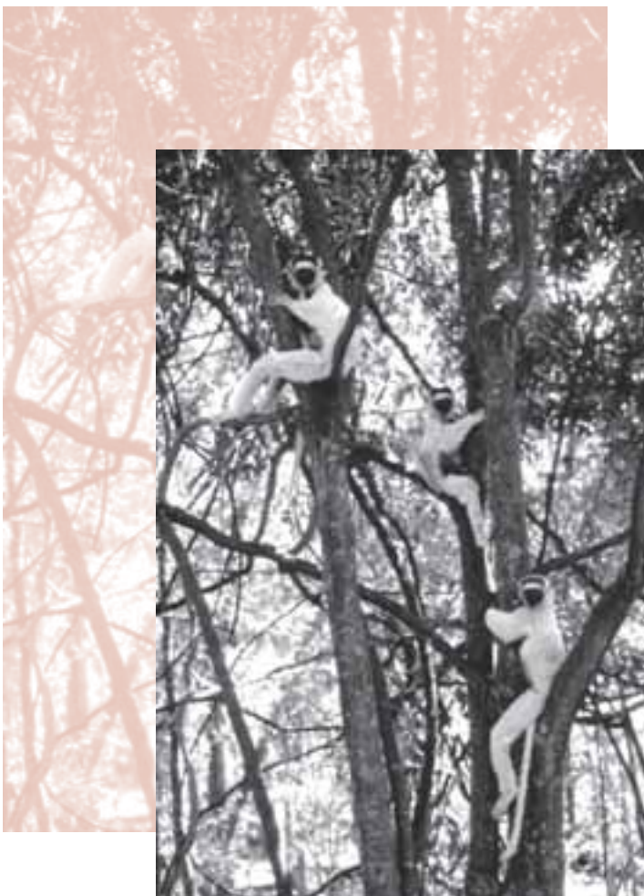
THE DIALOGUE CALLS FOR SUPPORT TO INITIATIVES THAT PROMOTE AND ENHANCE BIODIVERSITY.

(b) Develop comprehensive closure strategies and plans: Strategies and plans should be developed at the permitting stage and include direct and secondary impacts. They should be reviewed at least once every five years and be informed by baseline and ongoing surveys developed from an understanding of ecological