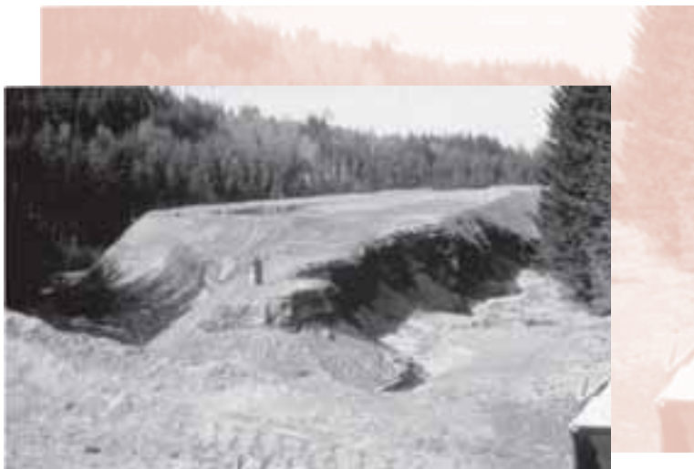
LEAD-ZINC TAILINGS DERIVED FROM A MINE IN THE SNOWDONIA NATIONAL PARK IN WALES, LAST ACTIVE IN 1954. NOTE THE SERIOUS SHEET EROSION OF THE WALLS AND THE TOP LEFT.

In addition to the Dialogue with IUCN, ICMM is also working with other organizations, notably with the World Bank Group to develop community management tools, and with the Global Reporting Initiative to develop a Mining and Metals Sector Supplement of the GRI Sustainability Reporting Guidelines. The IUCN-ICMM Dialogue will contribute to these complementary processes of defining best practice in mining.