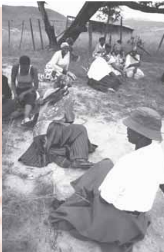
STAKEHOLDER INPUT IS CONSIDERED ESSENTIAL FOR THE SUCCESS OF THE DIALOGUE. PICTURED: ENVIRONMENTALIST AND LOCAL COMMUNITY MEMBERS DISCUSS ENVIRONMENTAL MANAGEMENT.