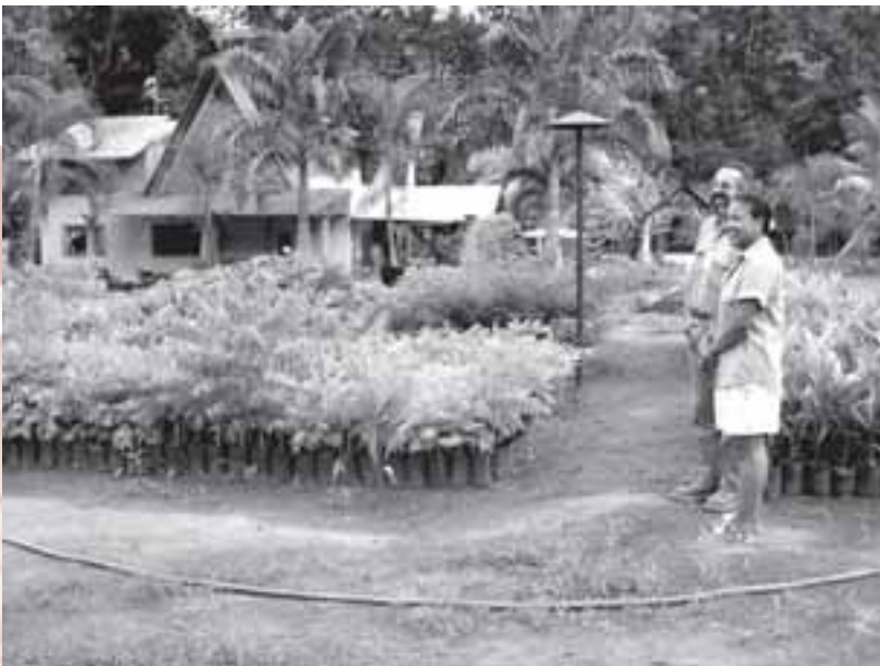
THE DIALOGUE RECOGNIZED THE NEED TO SPREAD 'BEST PRACTICE' WIDELY. PICTURED: INDUSTRY MANAGER IN DISCUSSION WITH A REPRESENTATIVE OF THE COMMUNITY WHICH IS GROWING TREES FOR USE IN THE MINE'S REFORESTATION PROGRAMME.

5.1.5. There is a need to spread the "best practice" in community and biodiversity as widely as possible – within (and beyond) the ICMM membership and IUCN