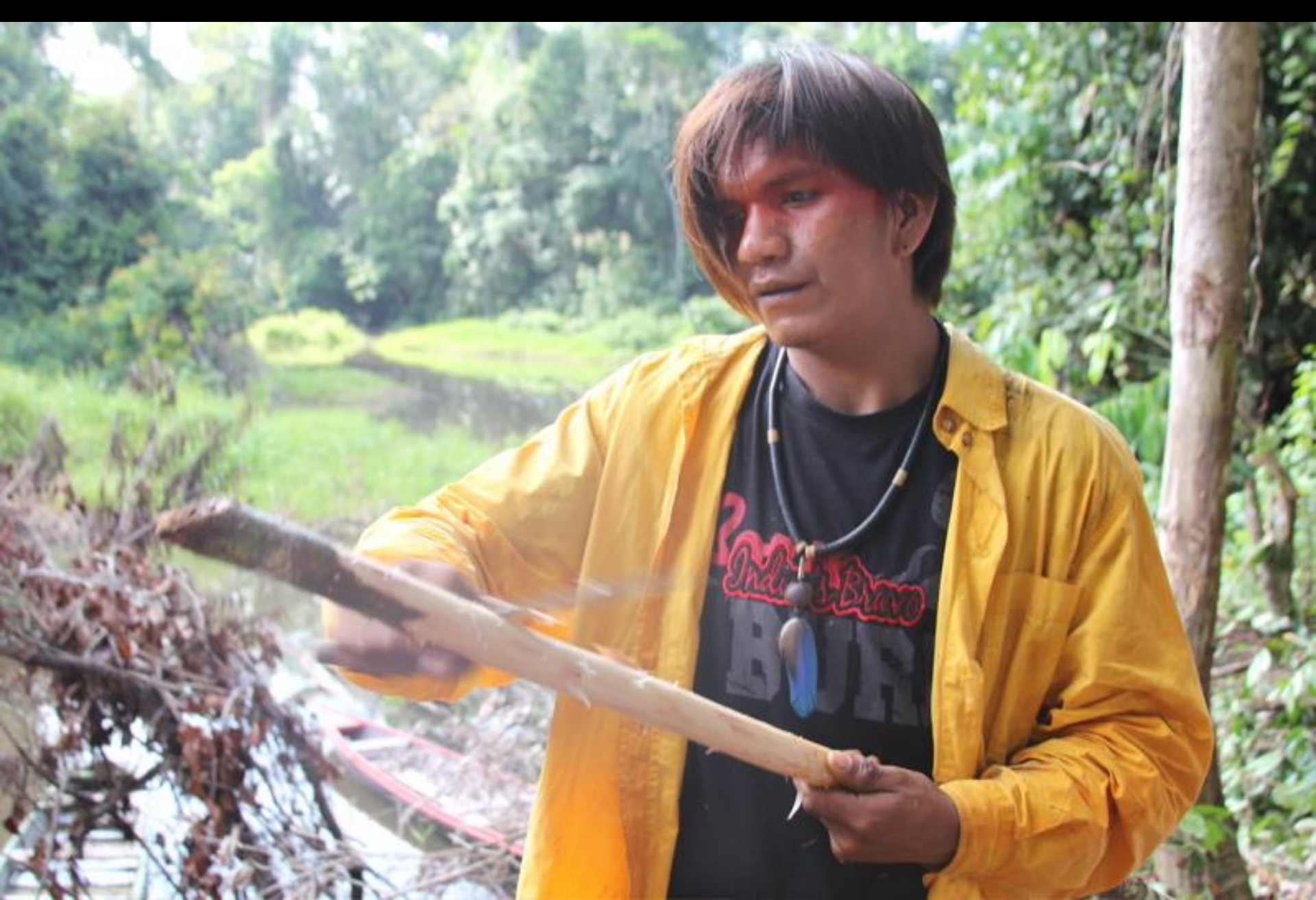
Preparing the instrument to fish