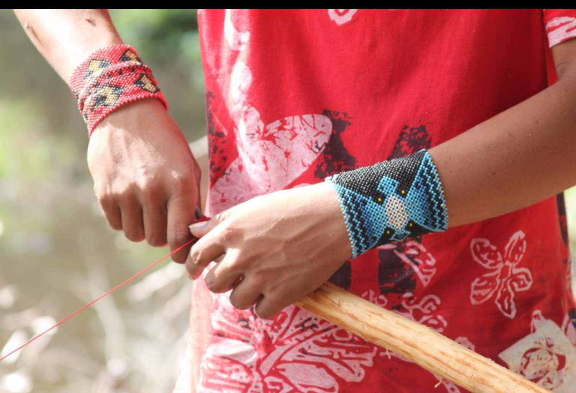
Tying the hook to catch fish