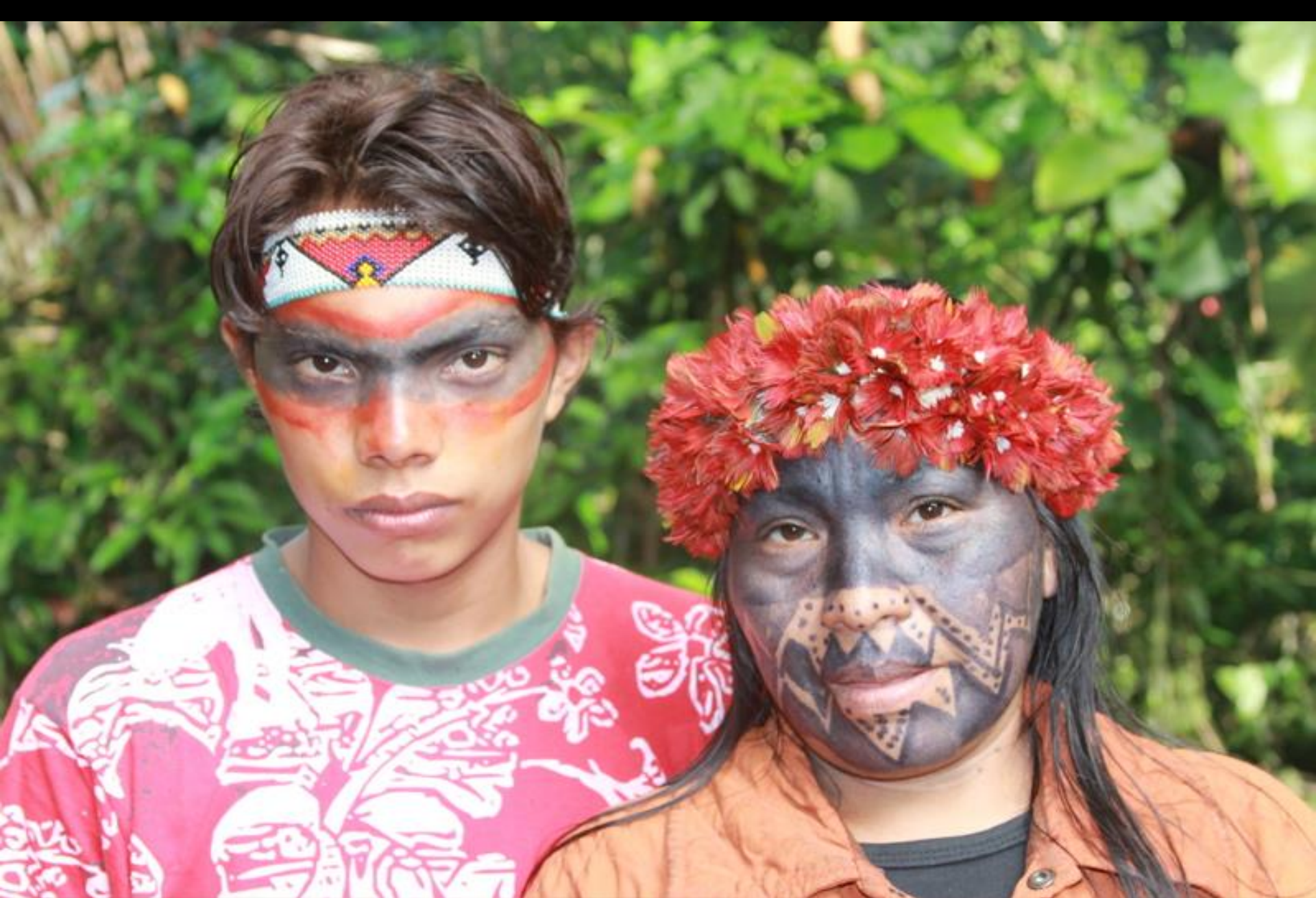
Generations together to strengthen and maintain the culture Yawanawa