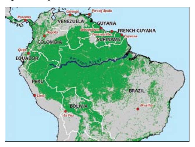
Figure 1: Map of Amazon Basin countries

organised as follows: Section 2 describes the drivers of land-use change and deforestation; Section 3 reviews current PES experiences in the region; and Section 4 comprises concluding remarks.