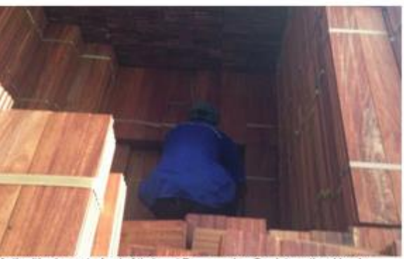
Authorities inspect a load of timber at <u>Dansavan</u>-Lao <u>Bao</u> international border checkpoint in <u>Savannakhet</u> province recently.

A huge quantity of contraband timber has been seized in Savannakhet province over the past three months since Prime Minister ThonglounSisoulith issued an order to clamp down on illegal logging.