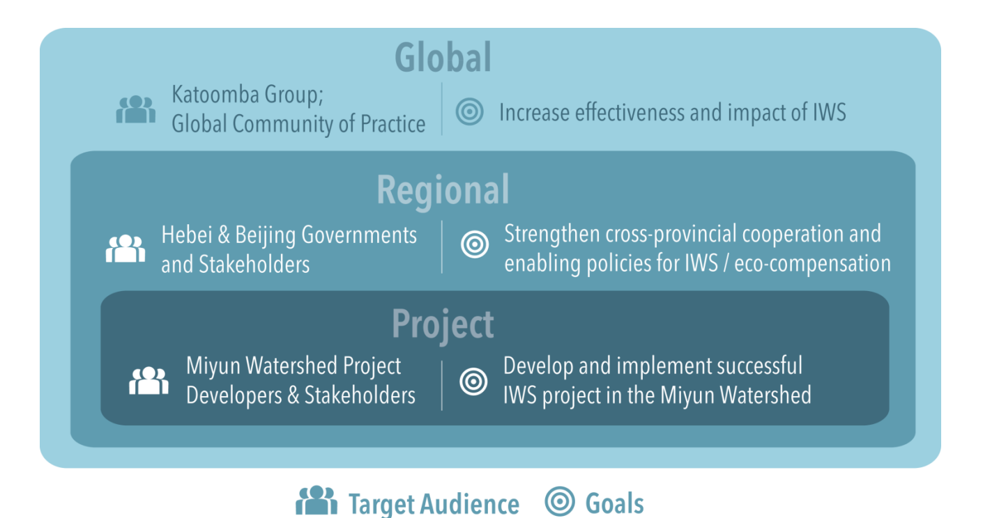
Figure 1. Three nested levels of action for strengthening investments in watershed services

Over the four-day meeting, participants presented and discussed innovative approaches from China and around the world for addressing water risk through investments in natural infrastructure. Sessions focused on innovative financing for natural infrastructure, new approaches by governments and business, managing the water-energy-food-nexus, and urban partnerships for watershed protection. Participants also delved into ongoing investments in Beijing's watershed, focusing on efforts led by the neighboring Beijing Municipality and Hebei Province. Drawing on insights and observations during the meeting as well as experience from around the world, meeting participants developed recommendations for action for three audiences (see Figure 1). Recommendations for the global community of practice are the focus of this document; recommendations for the regional policy makers and pilot project developers may also be accessed at http://www.forest-trends.org/katoombachina.php.