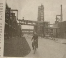
A Chinaland refinery in Shandong province. The company says it is open to establishing joint ventures with foreign partners.

SINGAPORE—One of China's largest independent refiners is reaching out to foreign companies to help build plants and upgrade ports to ease its access to oil, the refiner says. The refiner, which is one of the largest in China, is looking for foreign companies to help build plants and upgrade ports to ease its access to oil, the refiner says.