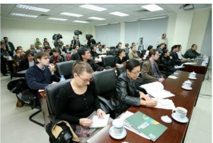
Report PDF download at:

http://www.greenpeace.org/china/zh/press/reports