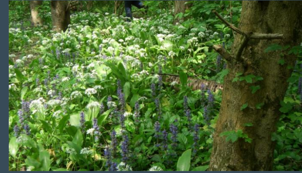
Tree spade moving coppice stool at A2/M2 Bluebells at Brickhouse Wood Receptor site Biggins Wood 20 years on