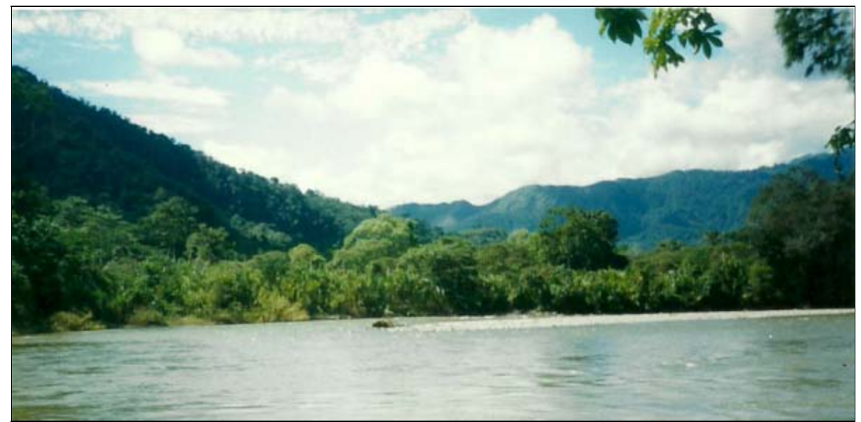
Selva Central en la Amazonía Peruana: área de implementación del proyecto MACC

This will be carried out via an efficient coordination among institutions, and will be implemented by the Ministry of the Environment, the National Service for Protected Natural Areas (SERNANP) and the Peruvian Trust Fund for Natural Parks and Protected Areas (PROFONAPE). The project is made possible by the German Financial Cooperation through KfW and the German Federal Ministry for the Environment, Nature Conservation and Nuclear Security - BMU by its German acronym.