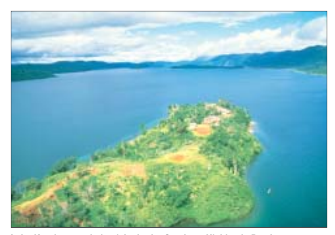
Lake Kutubu-a pristine lake in the Southern Highlands Province

protected area. Chevron Nuigini implemented extensive measures to protect the environment and avoid disturbing tropical rain forest areas. These included burying project pipelines, reinjecting produced water, minimizing road construction, eliminating spills, and comprehensively managing wastes, among many others.