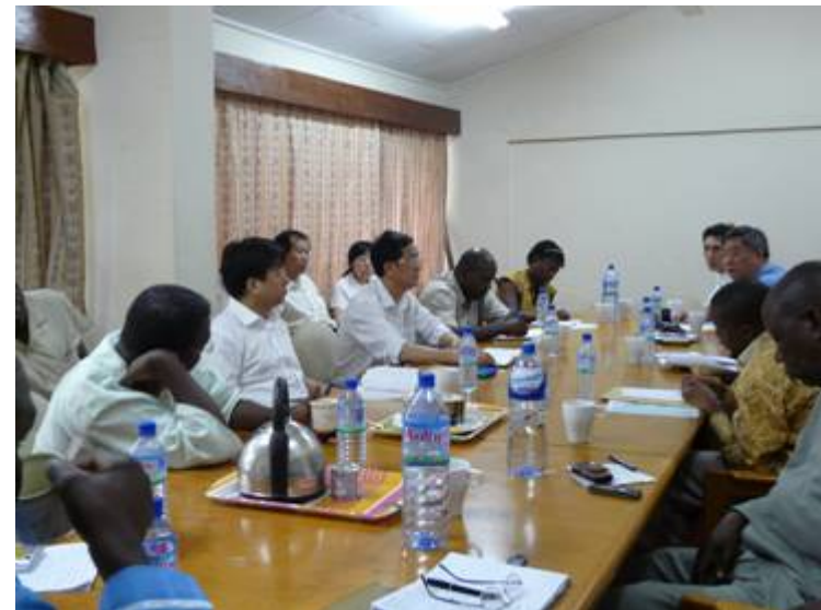
Civil society organizations roundtable workshop in Ghana