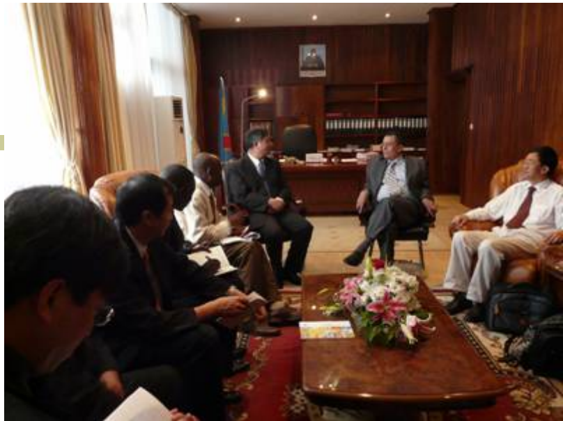
Meeting with the Minister of the Ministry of Environment of DRC