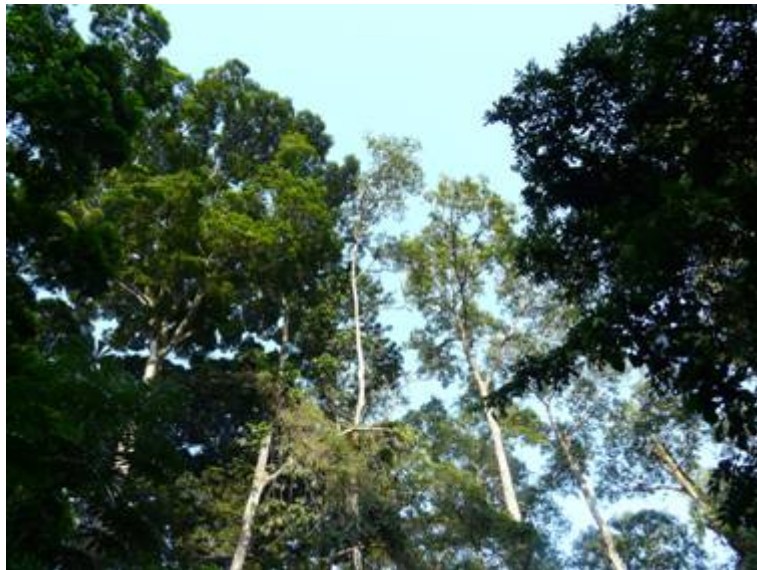
Rich forest resources in Gabon