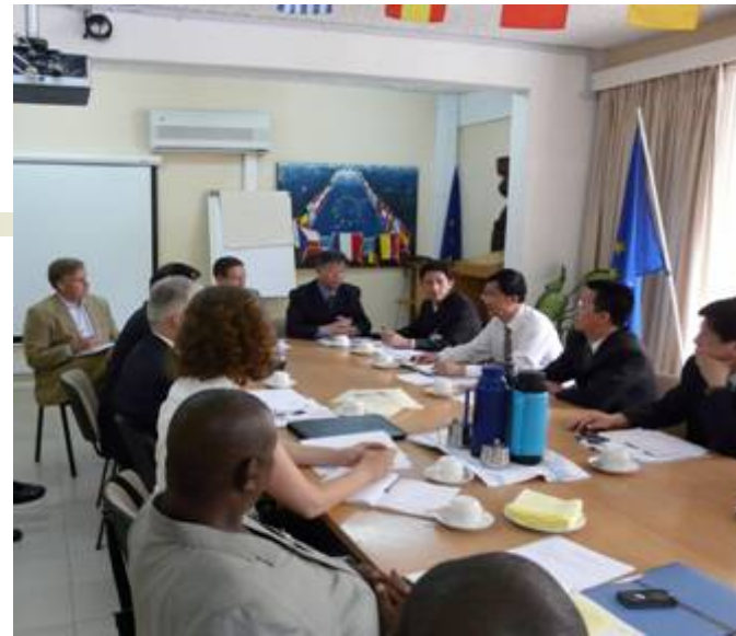
Meeting with international organizations in Ghana