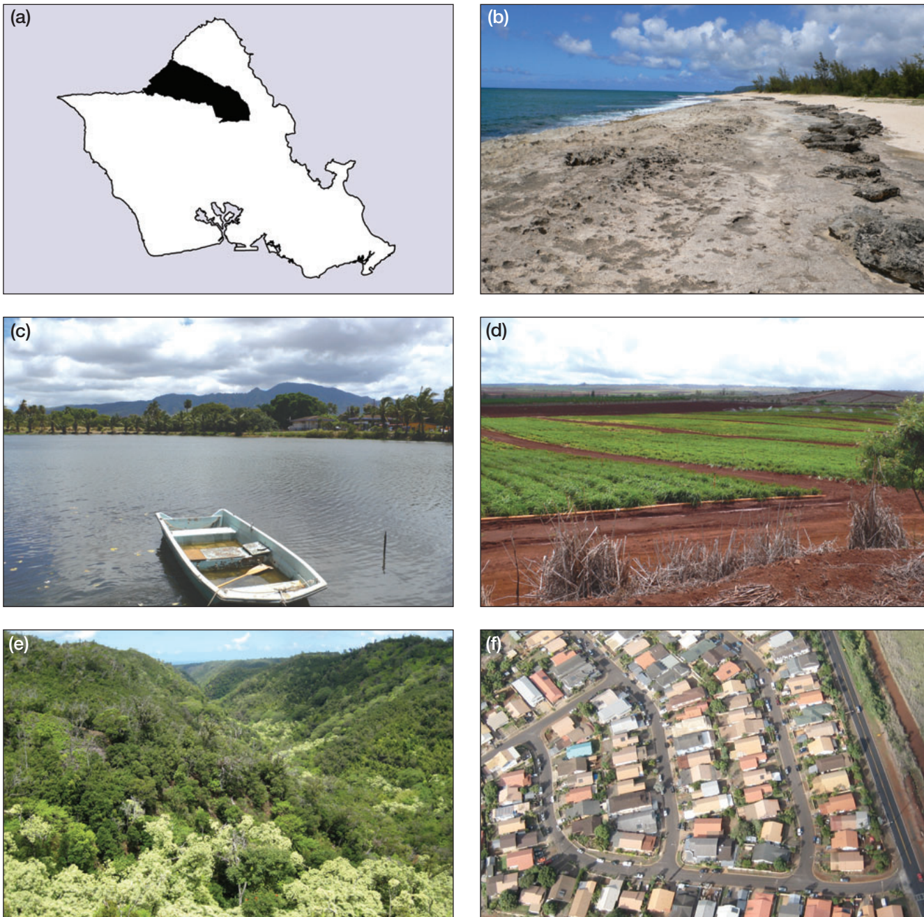
Figure 4. Using InVEST to help assess management options for (a) a land-holding of Kamehameha Schools (Kawailoa, O'ahu). This 26 000-acre parcel has (b) prime undeveloped coastline, (c) an ancient fishpond and other important cultural assets, (d) a highly productive agricultural belt with water resources, (e) biodiverse native upland forest, and (f) commercial and residential areas.

best be conveyed in other ways (eg the cultural importance of natural places), because assigning credible monetary values is difficult or less meaningful.