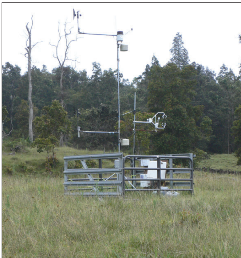
Figure 3. A micrometeorological station for quantifying the roles of pasture and nearby forest in recharging groundwater supplies for local water users. Palani Ranch, Kona, Hawai'i.

native ecosystems (Cuddihy and Stone 1990; Maguire et al. 1997). Conservation and restoration are a key focus today (Manning et al. 2006; Goldstein et al. 2008), as are new remote sensing systems for characterizing biodiversity and ecosystem structure and function at large scales (Asner et al. 2008).