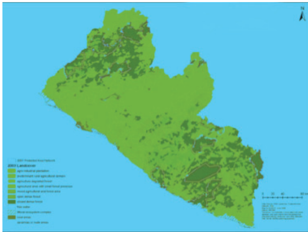
FIGURE 1: Liberia's Forest and Land Cover (2003)