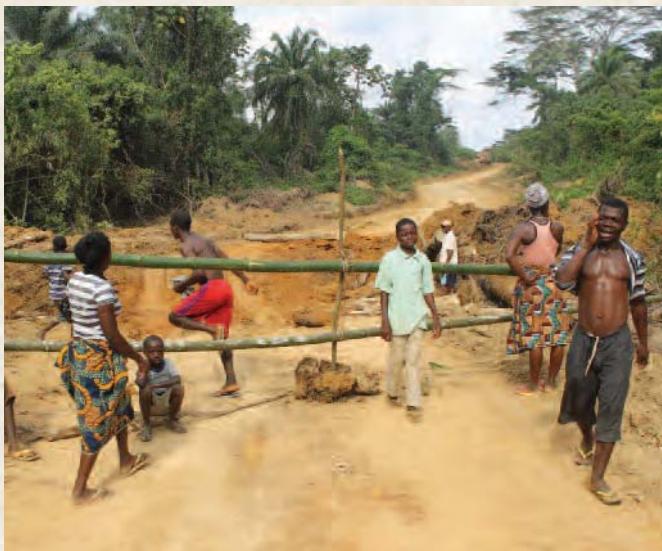
Community members erecting a road block along the Forest Venture/ICC logging highway in Rivercess County.

According to the CFDC, they lodged complaints with the FDA regarding these issues. The FDA in a letter addressed to the CS-IFM team denied receiving a formal complaint from the CFDC. 22 When the FDA and the company failed to address their concerns, community members created a roadblock to prevent Forest Venture and ICC from entering the concession. On April 2, 2014, the ICC, in a meeting with community representatives including the Chairlady, Youth Leaders, Elders, the CFDC and FDA in Zoryea Town, confirmed that it is responsible for delivering the community's benefits under the Social Agreement. A representative of Forest Venture also participated in this meeting. 23 However, follow up investigations found that ICC is still not meeting its obligations as enshrined in the Social Agreement fully.