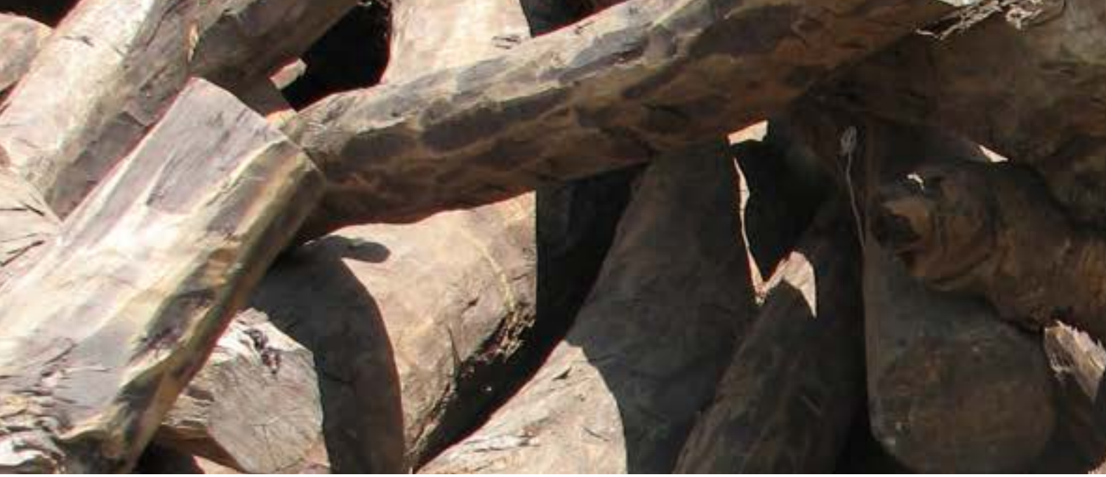
Front cover © Samantha Gunasekara; Inside page © Samir Sinha

Red Sanders Pterocarpus santalinus , or Red Sandalwood, is an endemic tree species with distribution restricted to the Eastern Ghats of India (Arunkumar and Joshi, 2014). It is known as 'Lal Chandan' , 'Rakta Chandan' in Hindi (Bhagyaraj, 2017),