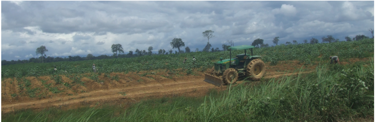
mechanized agribusiness concession, Hukawng Valley, Kachin State