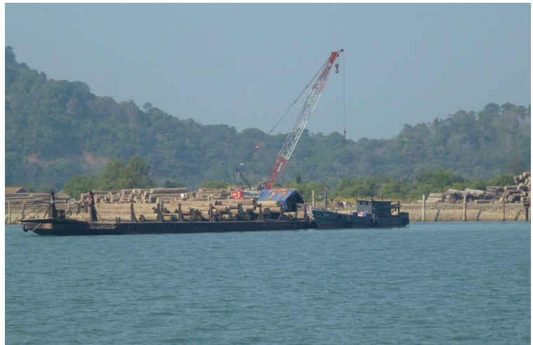
Photo credit: Local researcher, timber barge, oil palm concession area, Tanintharyi Region